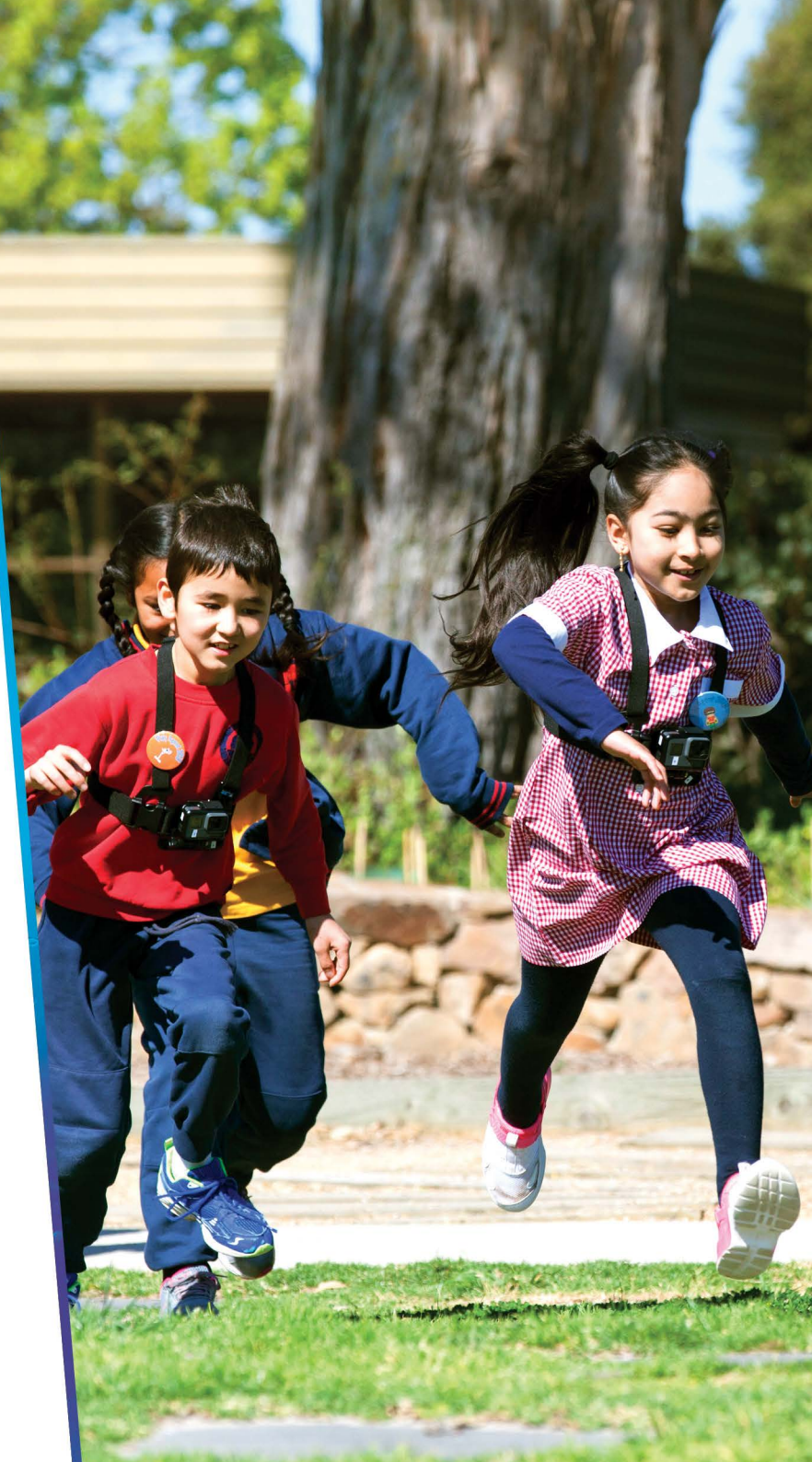
Image: Children from Noble Park Primary School were active participants in our research about the role of play in helping newly-arrived students thrive.