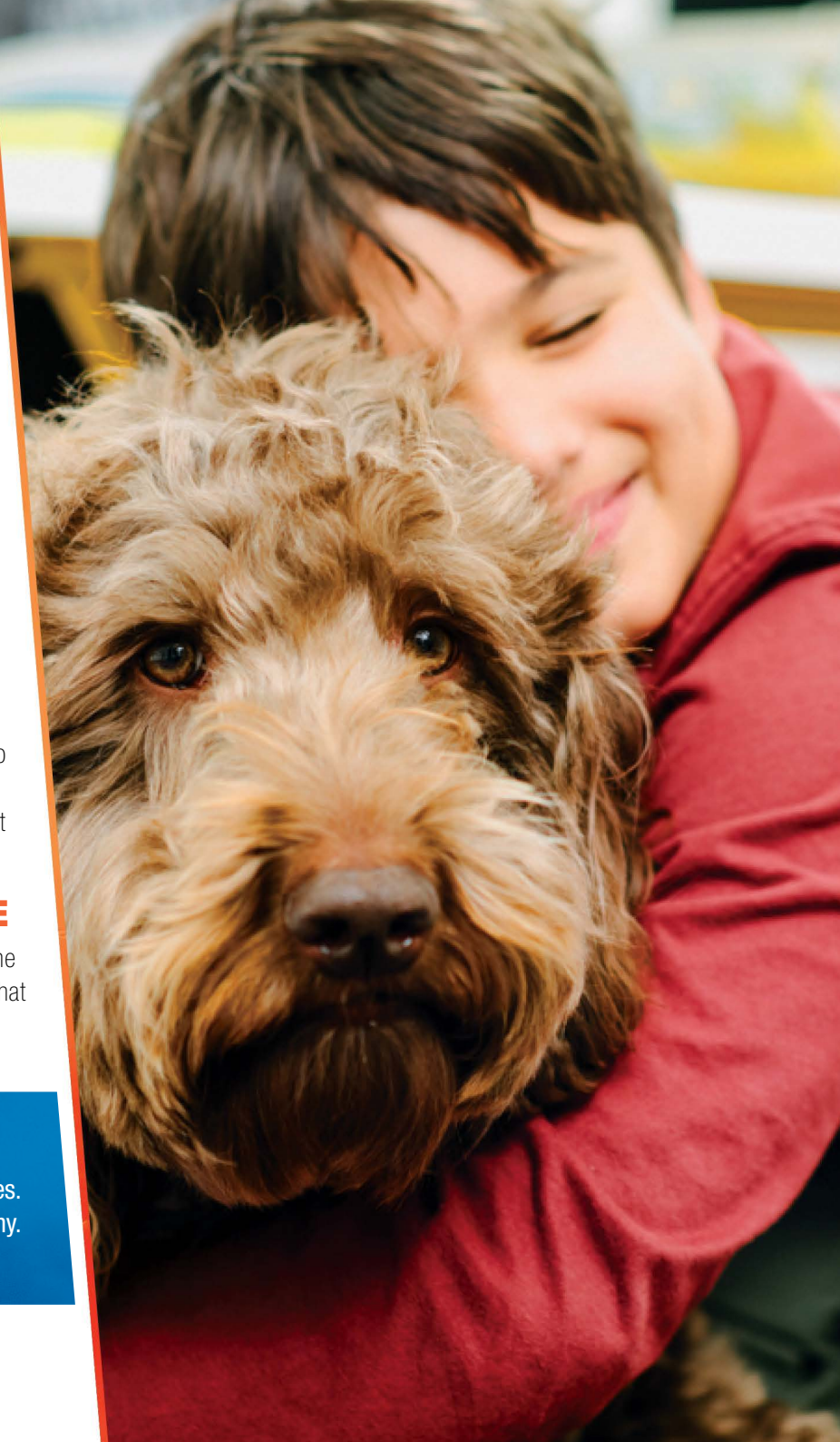
Image: Bronson the Labradoodle is part of Australian-first research into the use and effectiveness of therapy dogs.