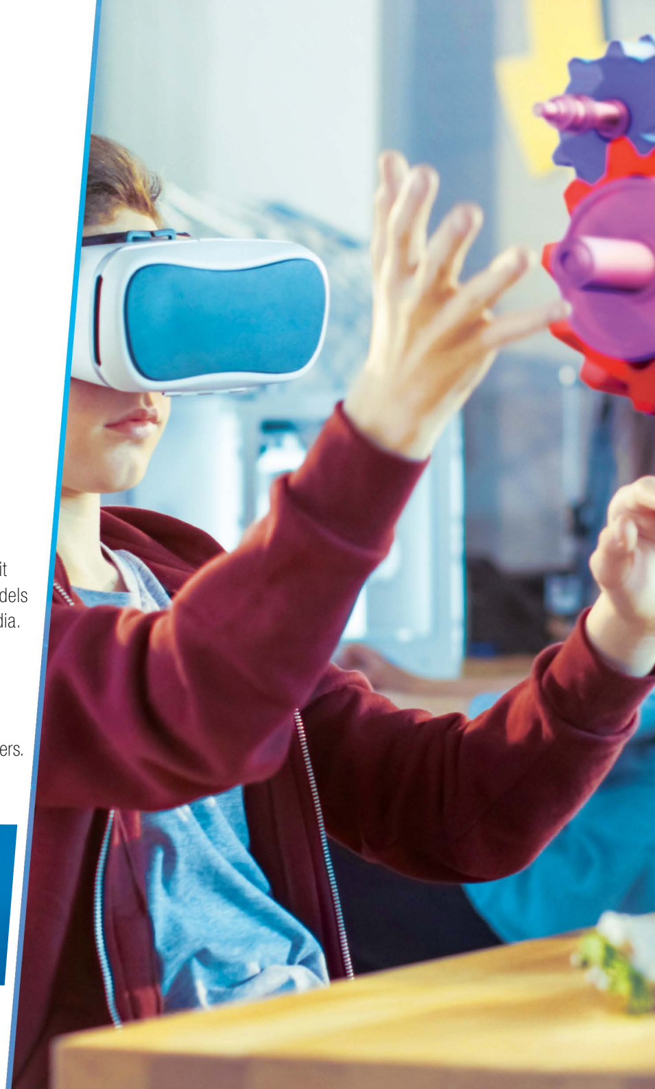
Image: Our research in digital futures takes a critical look at the impact of digital technology in the classroom and provides the basis for evidence-informed practices in schools.