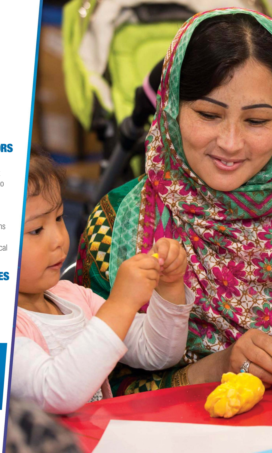
Image: Narre Warren South P-12 College partnered with us to develop and test a new model of support for students and parents from linguistically and culturally diverse communities.

● We inform policy development and implementation in inclusive education. ● New funding models are developed and tested for disadvantaged youth. ● We help build social cohesion by co-designing and co-delivering research and programs. ● We develop world-class professional practice programs for teachers and educators focusing on super-diversity and inclusion.