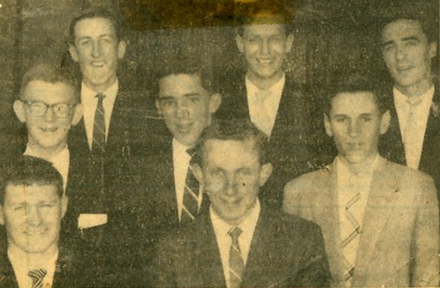
Back-to-School for these Frankstonians when they commenced studies at the Teachers' College, Frankston, last week.