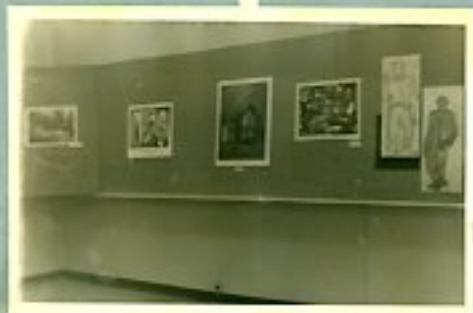
From Art room, Broadway, West