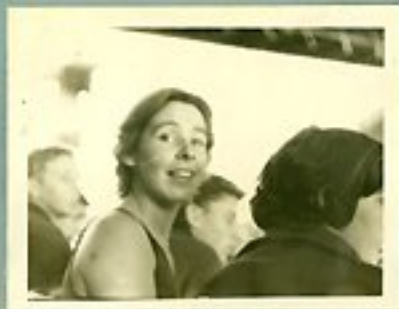
Visit Gray before competing