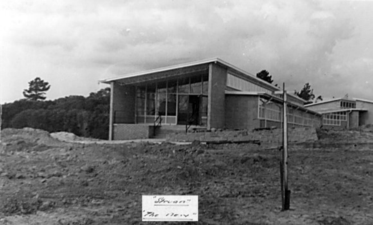
"Stream" "The New"