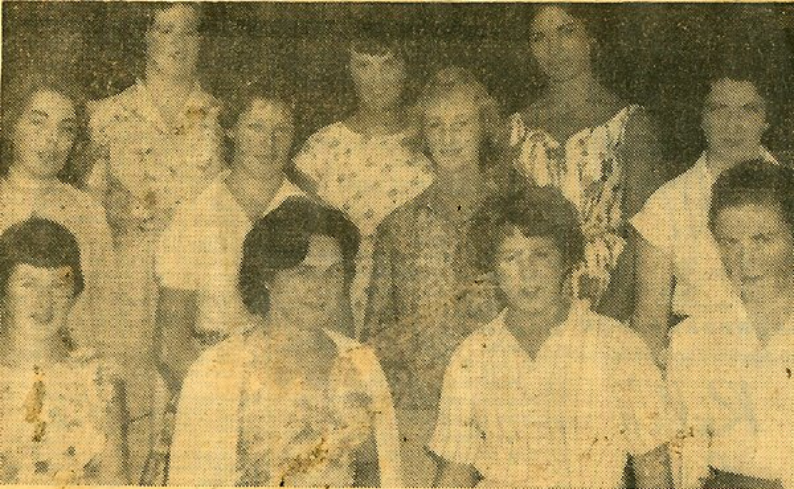
It was "Commencement Day" for these Frankston girls at the Teachers' College, Frankston, last week.