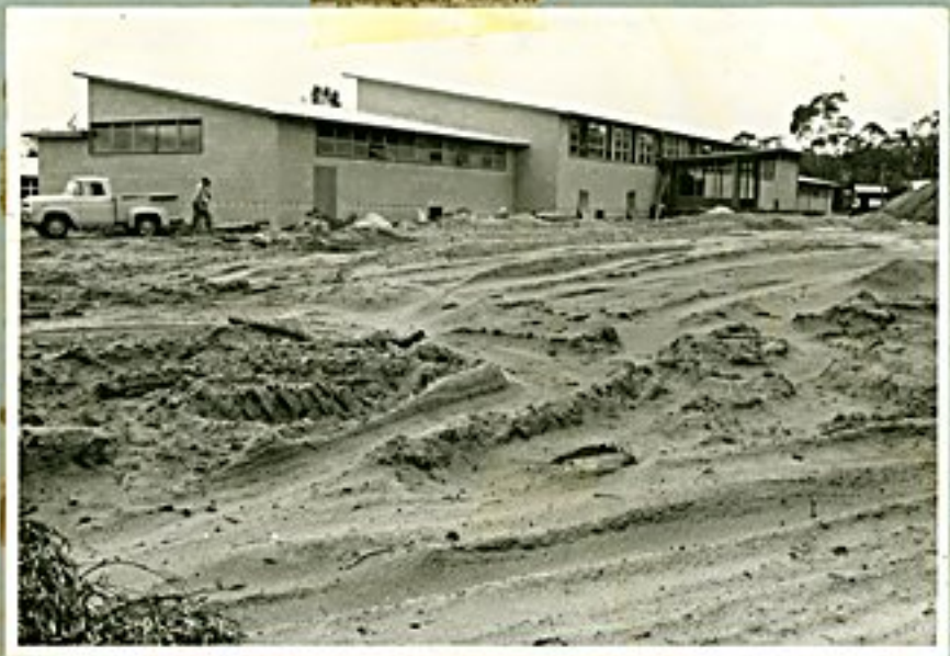
Leaving the New Gym.