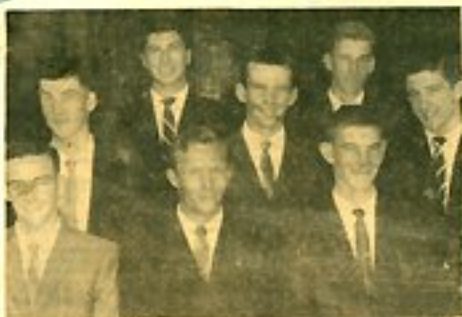
Students from Middle City who were named their school's the district Teachers College. If mentioned in with, are shown in this group.