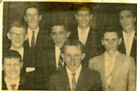
Back School for these Freshmen who they commenced studies at the Teachers' College, Franklin, last week.