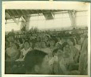
Activities at the LC&C