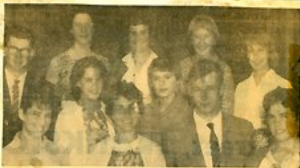
New students at the Teachers' College, Franklin, who came from Worthington and further down the Peninsula.