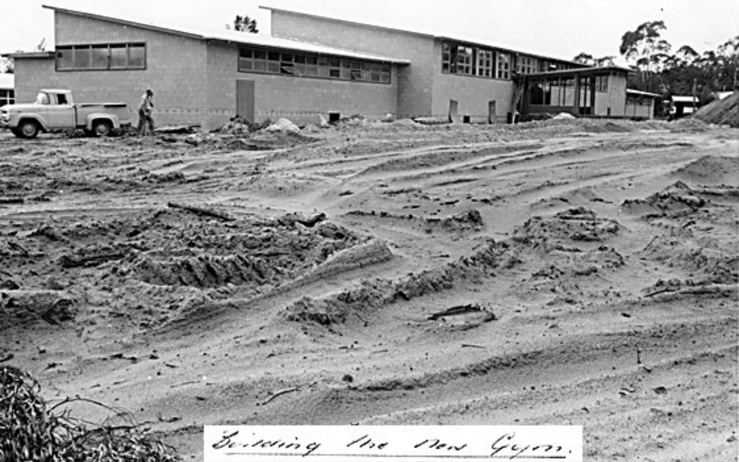
Finishing the new Gym.