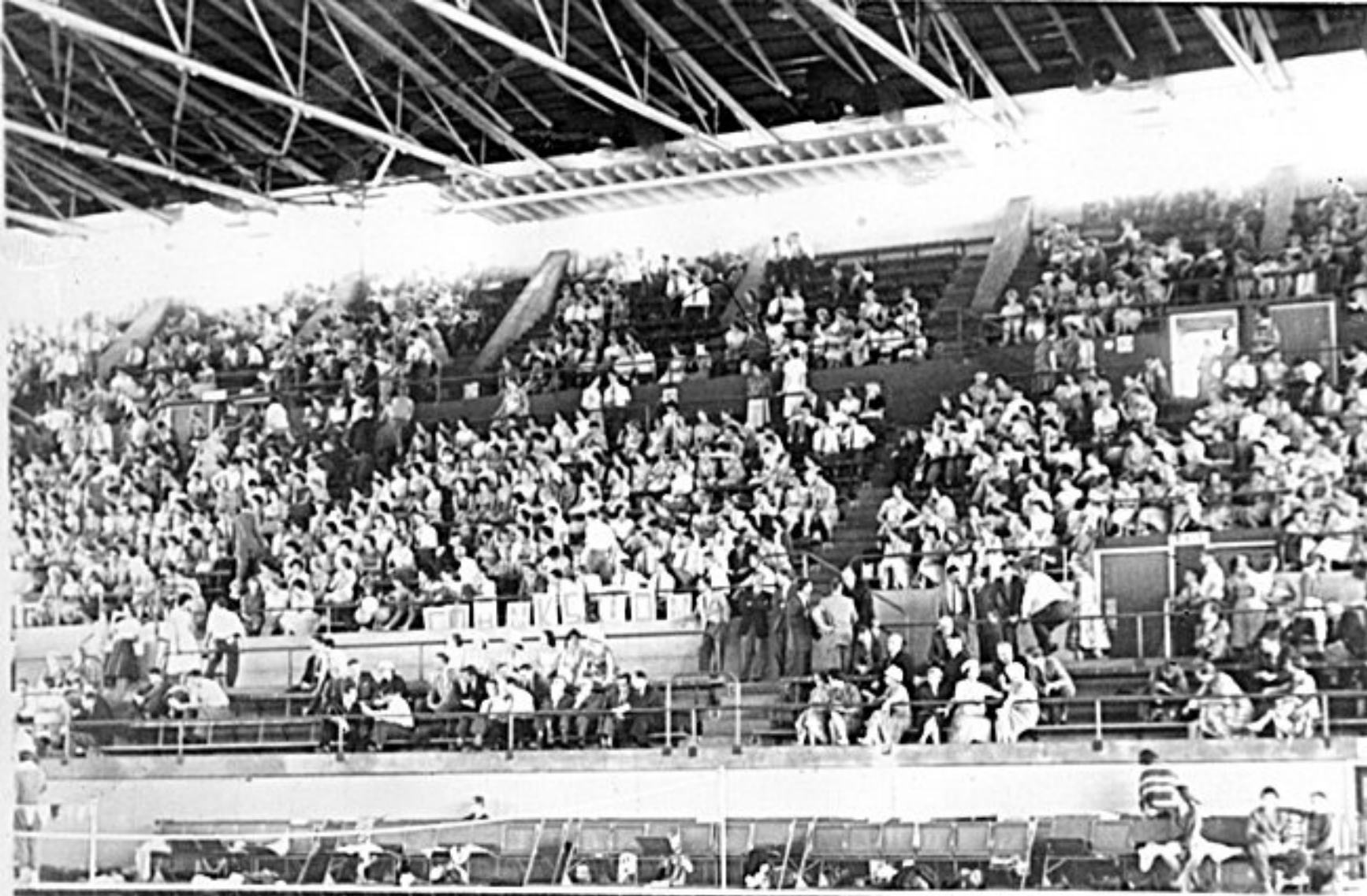
Swimming Sports 1966