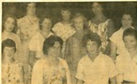
It was "Commencement Day" for these Frankston girls at the Teachers' College, Frankston, last week.