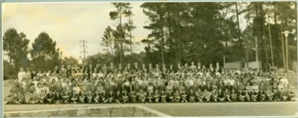
Staff and Students 1960