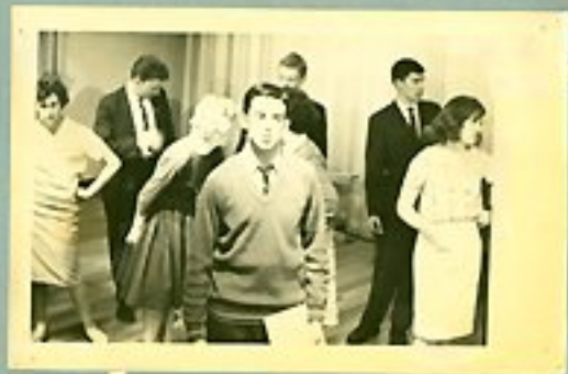
Scene on Stage