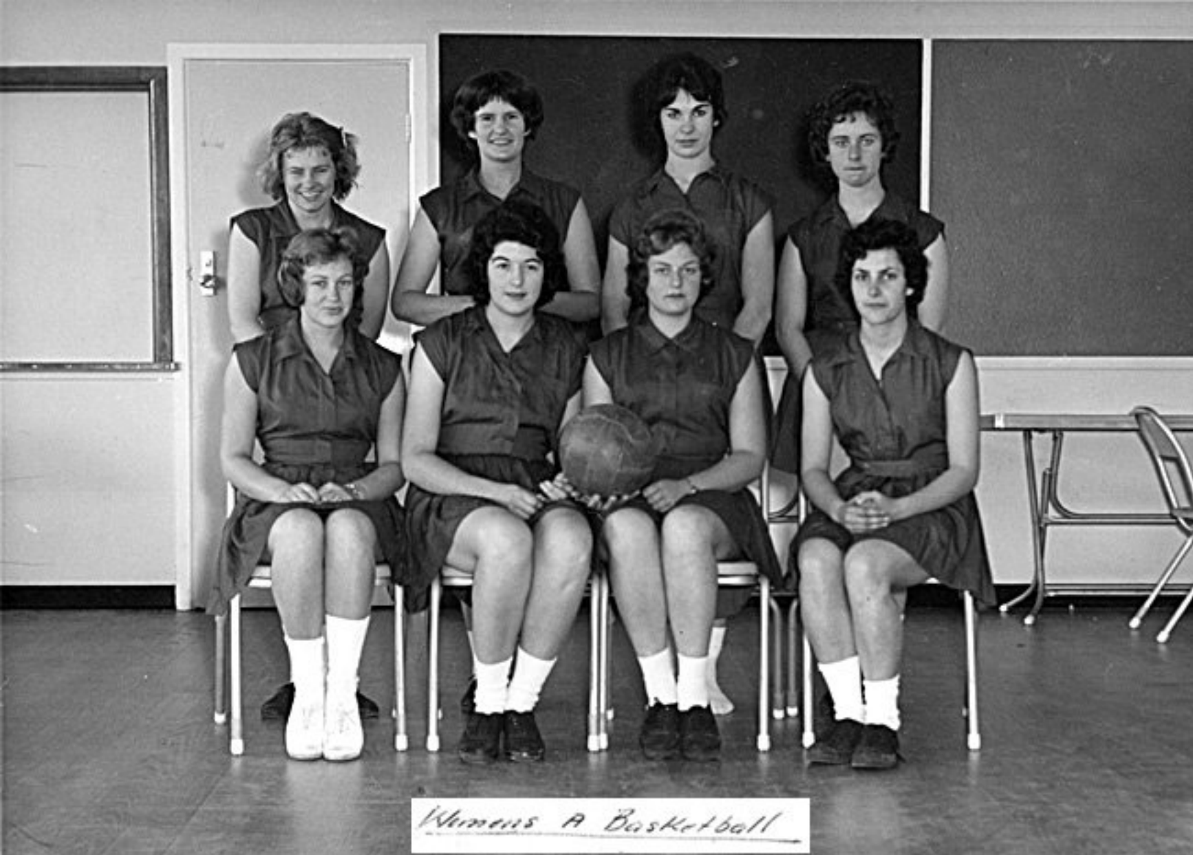
Women's A Basketball