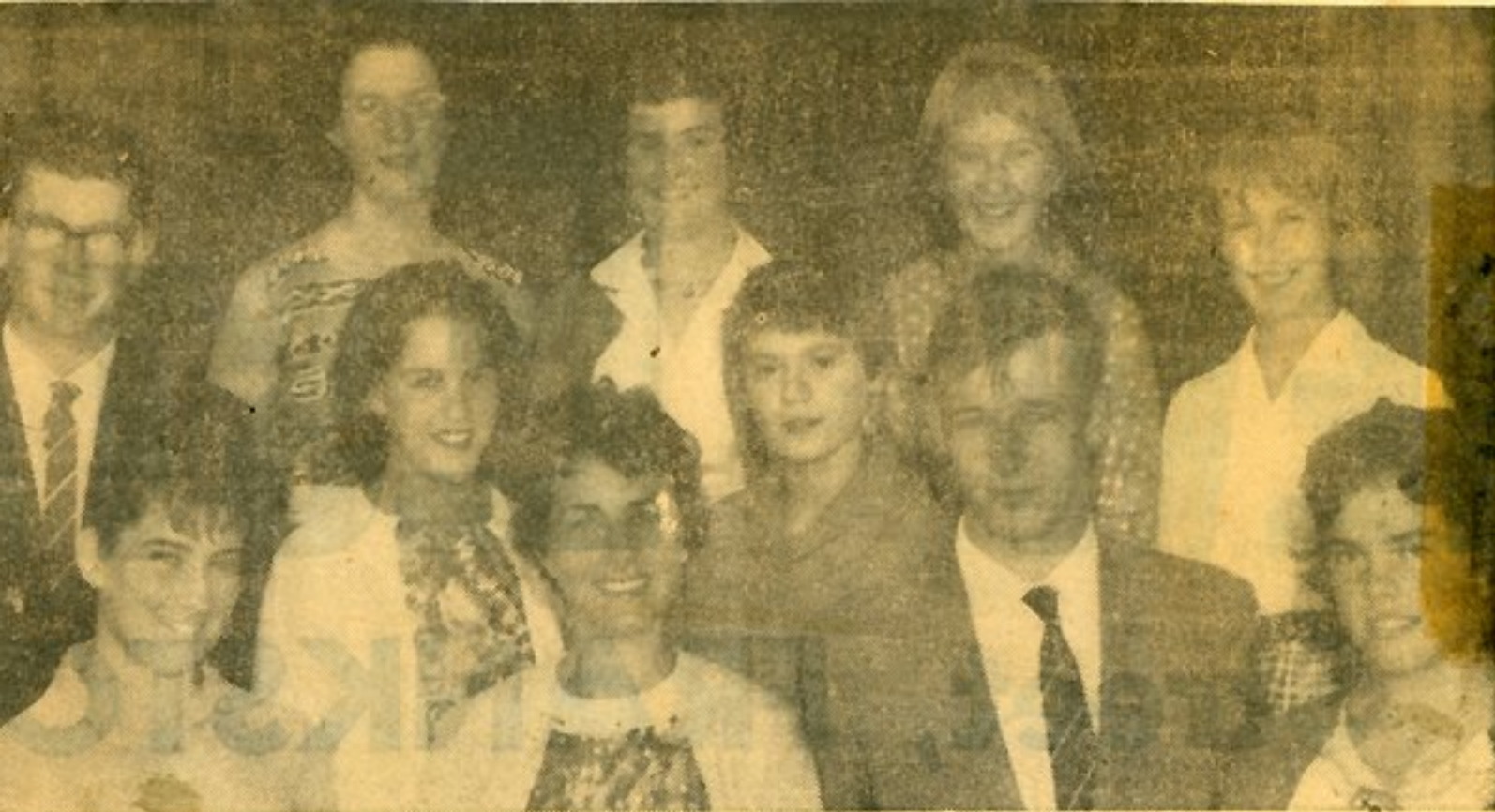
New students at the Teachers' College Frankston, who came from Mornington and further down the Peninsula.