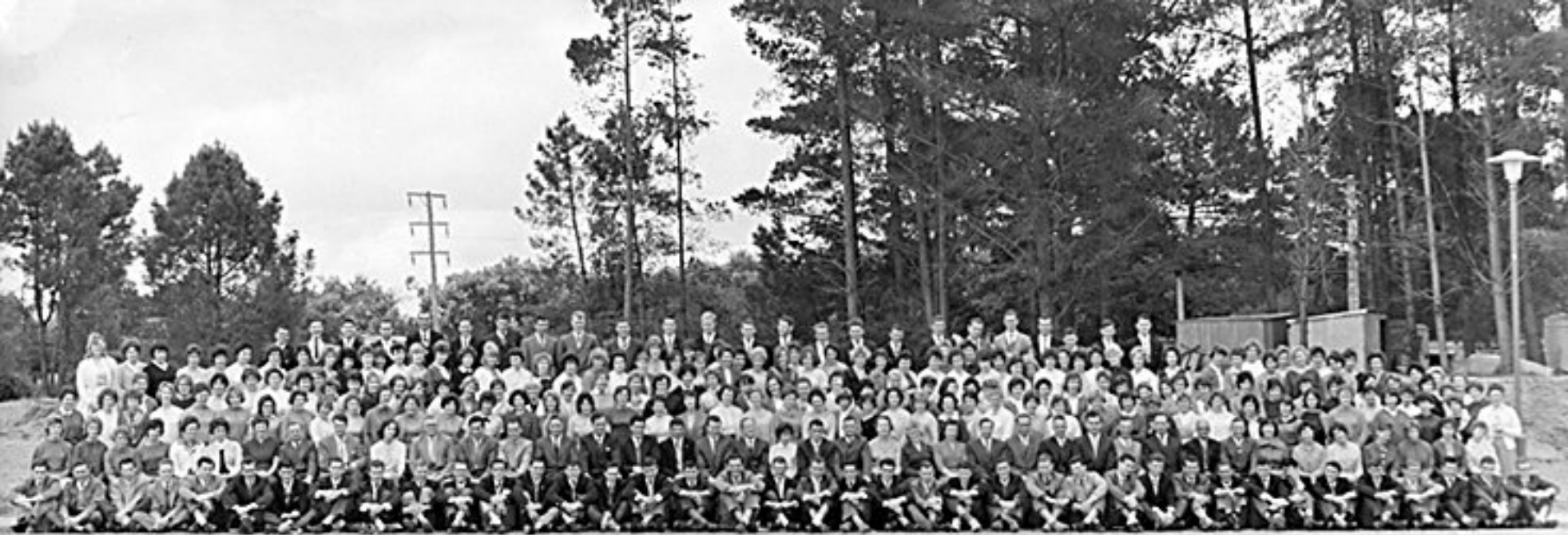
Staff and Students 1960