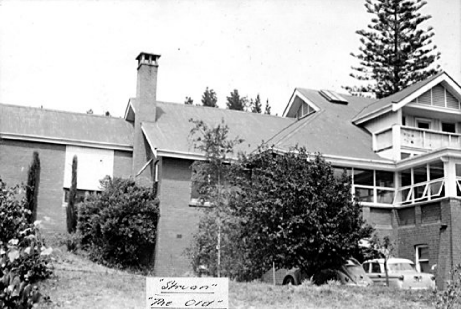
"Struan" "The Old"