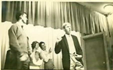
More on Stage