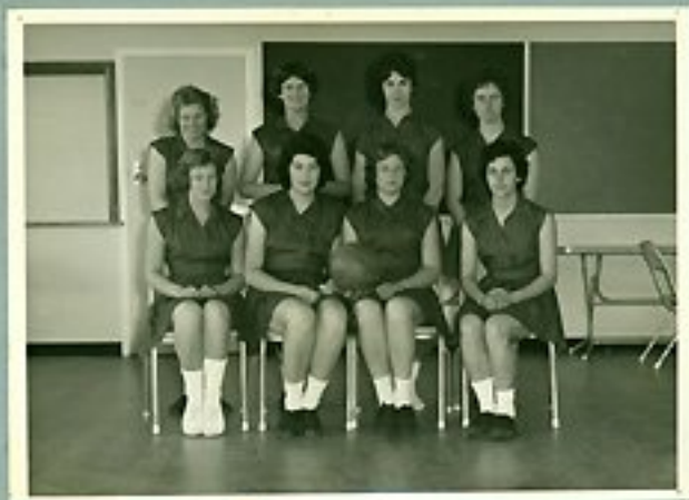
Homecoming # 4 - B Basketball