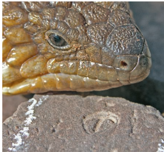
Contemplating evolutionary relationships? A stumpy-tail lizard ( Tiliqua rugosa ) gazing at an ancient Ediacaran fossil ( Parvancorina minchami ) in Australia.