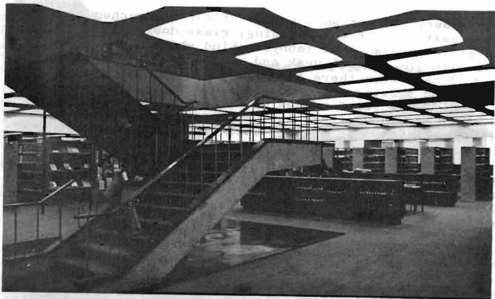
The Law Library, First Floor The Moot Court