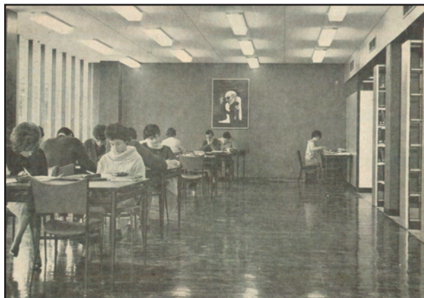
Reading room, Hargrave Library, 1962

Humanities and Sciences , but provide connection and inspiration for all fields of knowledge. Monash University was first to adopt in Australia a model with major branch libraries, rather than the traditional small, departmental libraries under the control of a large central library.