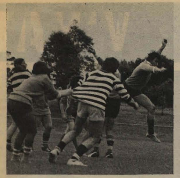
Was it ballet . . ?