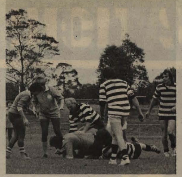
Tag-wrestling . . ?