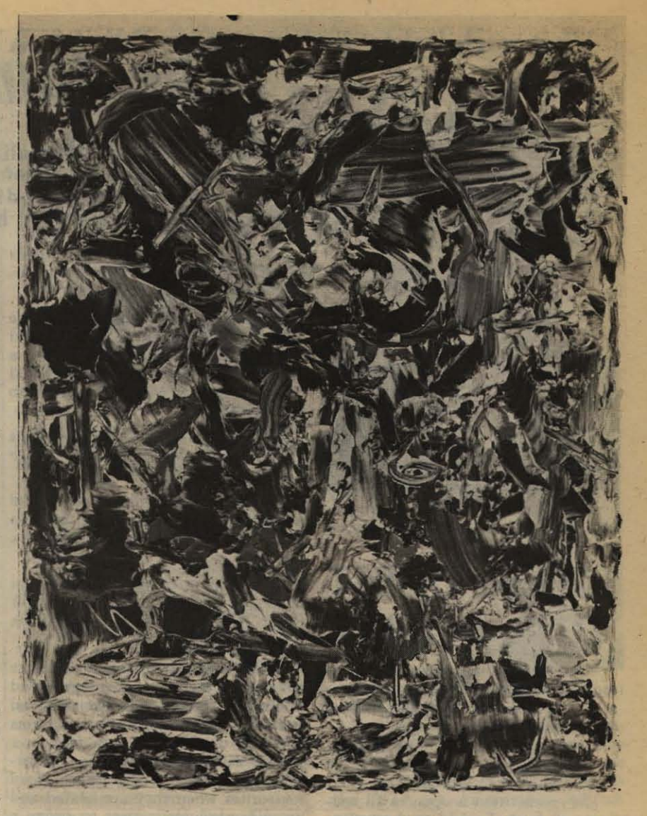
PAINTING, 1976, by Peter Booth. Acrylic on pulpboard. This painting is on display in the current Gallery exhibition.

Dr Feith says it is clear that inequalities within village society have grown in "leaps and bounds" in the Suharto period, indicating that a minority of landlords, rich peasants and village officials have been the major beneficiaries.