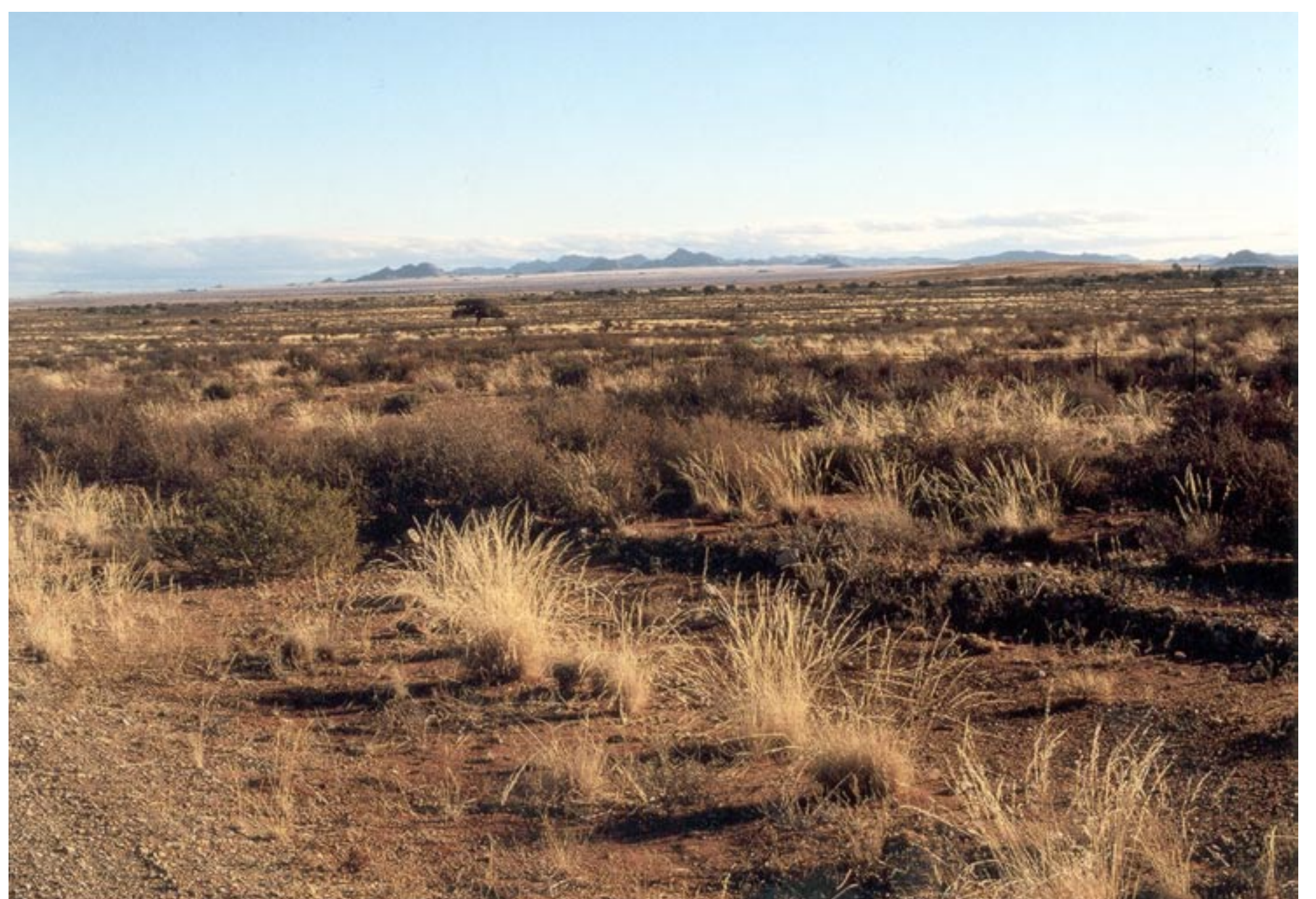
Near Grunau in southern Namibia, Nama Group rocks in the distant mountains.