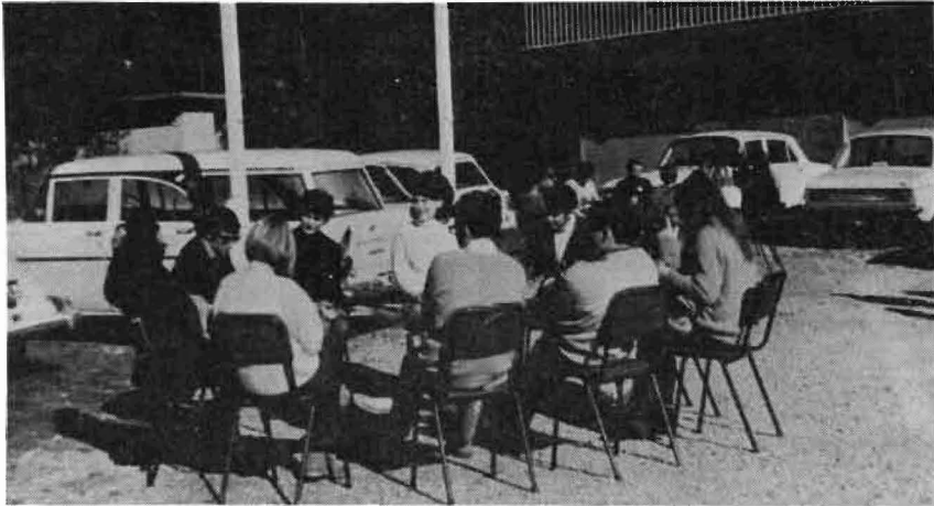
A discussion group at the Mount Evelyn camp 1969.

As in previous years, the counsellors will arrange staff discussion groups throughout first term for those members of staff taking part for the first time.