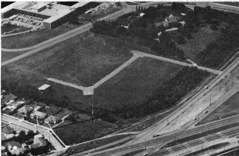
An aerial view of site of proposed hospital