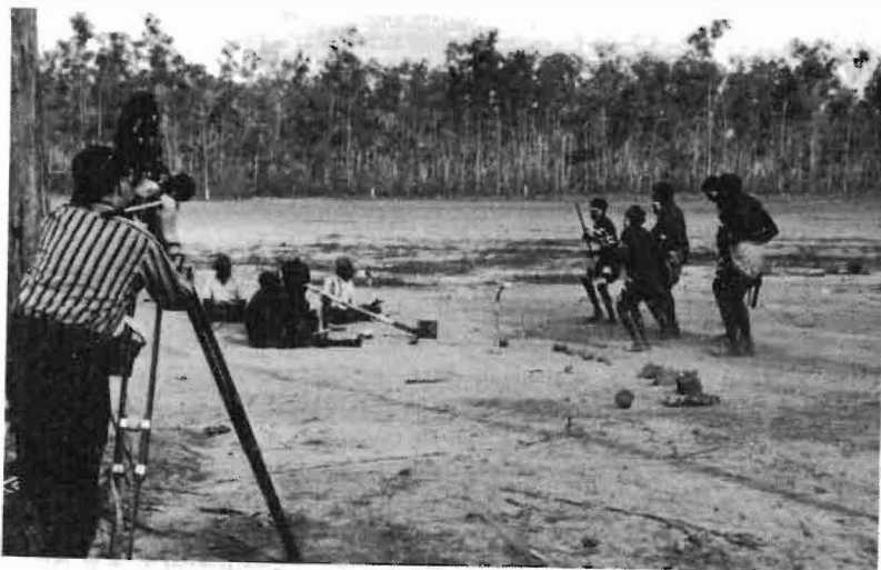
One of the camera-men filming a dance.