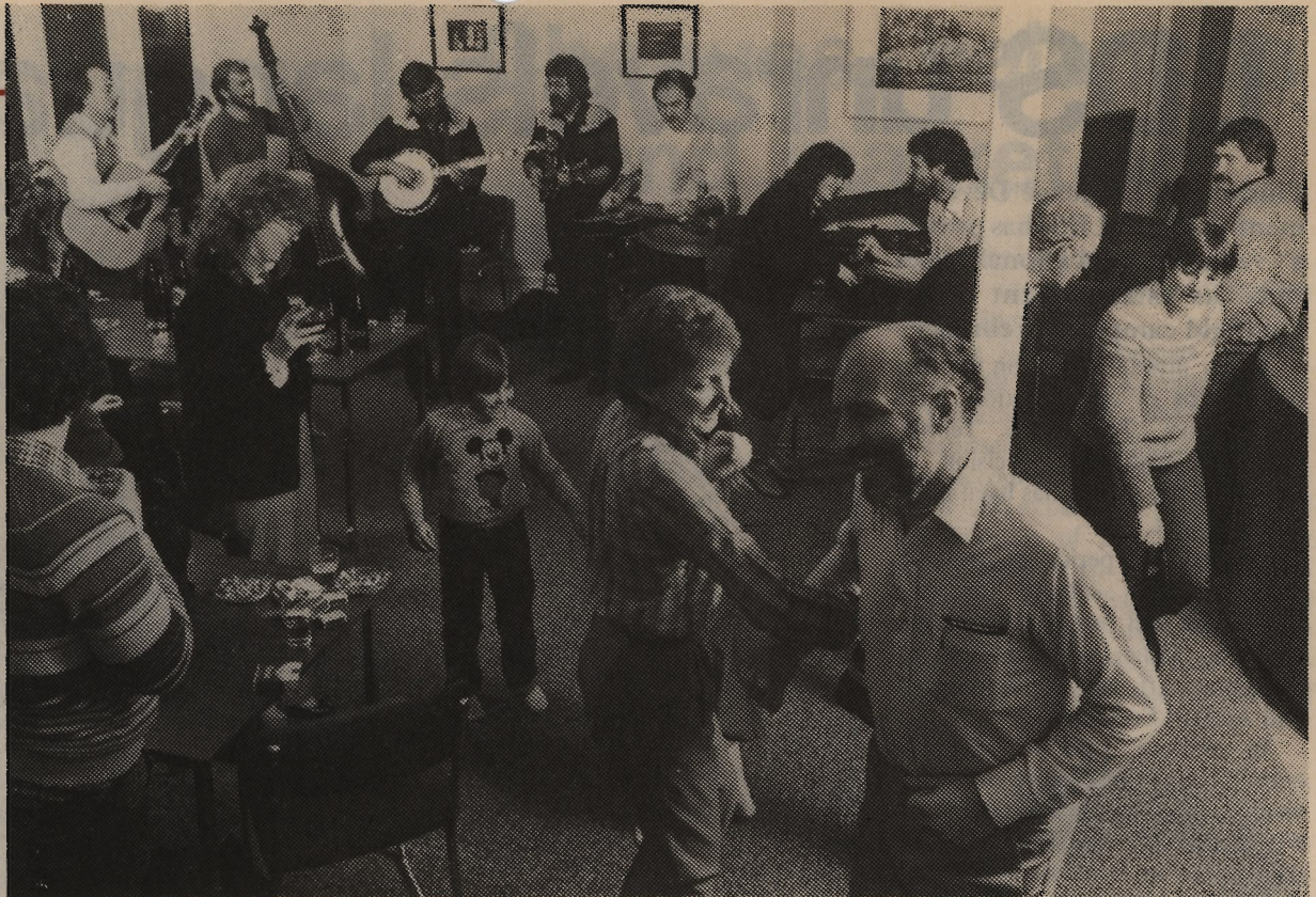
Dr Foster's Bluegrass Band had visitors to the Staff Club on Thursday, 20 September, kicking up their heels.

Visibility gallery. 8 - 30 September. Open weekends, 1 - 5pm. 642 Station Street, North Carlton.